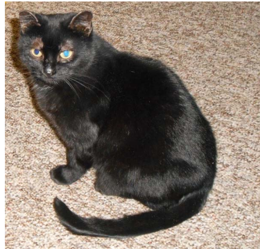
Squeaky fully recovered

Some folks find it hard to believe that so much effort is put into "animals" and not people. I simply tell them: (1) "If you were the One that had created all things then you would love all things; and (2) "The One who created all things has assigned (their gifts) to certain people to love and care for His special creations."