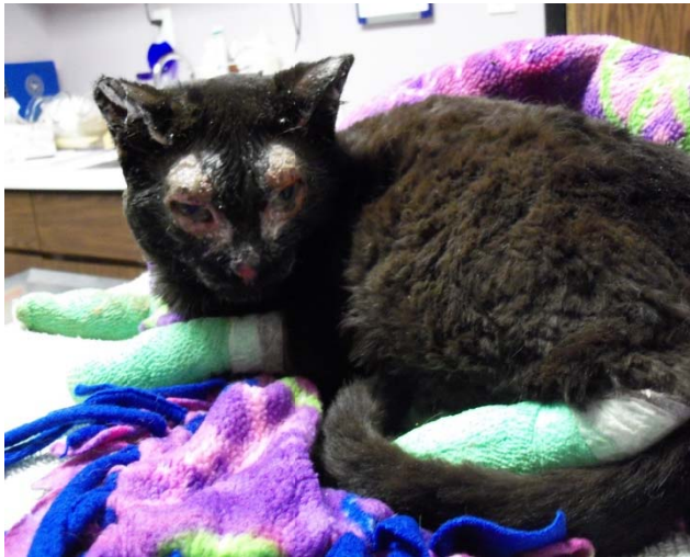
Squeaky after the fire

One of those cats was Squeaky. She was a semi feral cat that was spayed, vaccinated and released back into the colony of cats that she came from. The colony is provided with food, water and insulated, weatherproof habitats. On a warm Spring day Squeaky was laying under a brush pile. Two young men hired to burn brush, not knowing Squeaky was there, poured gasoline on the brush pile and ignited it. Squeaky managed to escape but was badly burned on her face and paws. She was spotted by volunteers several times but would run away. It took four days to find her. She had succumbed to her pain and injuries and was found lying on the floor of an empty garage on Easter Sunday. Squeaky was rushed to a vet hospital and so began her long recovery and healing. Squeaky left the vet hospital two weeks later and went to a foster home where she continued medical treatment and was showered with love, affection and socialization skills that she had lived without. Squeaky has fully recovered and was adopted by her foster Mom. She is now a happy house cat living with her owner and resident house cat, carrying only her scars as a reminder of her terrible ordeal.